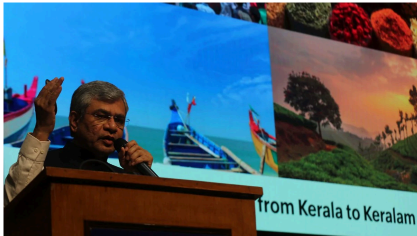
Union Minister Ashwini Vaishnaw in New Delhi on Tuesday.

4 min read New Delhi Updated: Feb 25, 2026 02:46 AM IST