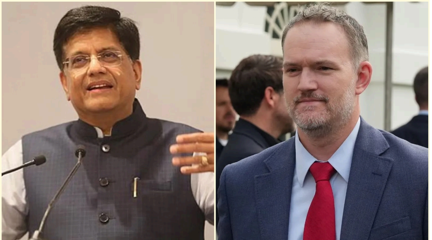
Commerce Minister Piyush Goyal and US Trade Representative Jamieson Greer