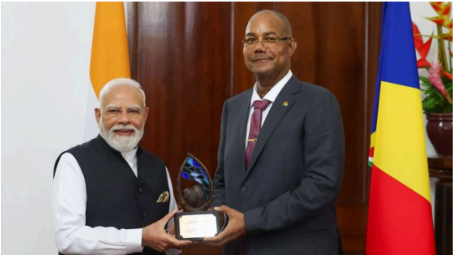
PM Modi was conferred with the 'Guardian of the Blue Horizon'

New Delhi Updated: Jun 29, 2026 02:27 AM IST